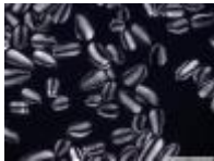
Optical micrograph (OM)