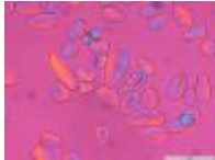
Optical micrograph (OM)