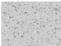
Optical micrograph (OM)