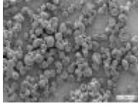
Scanning electron microscopy (SEM) image