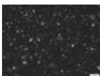
Optical micrograph (OM)