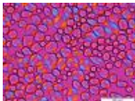
Optical micrograph (OM)