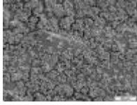
Scanning electron microscopy (SEM) image