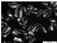
Optical micrograph (OM)