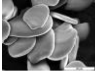
Scanning electron microscopy (SEM) image