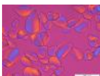
Optical micrograph (OM)