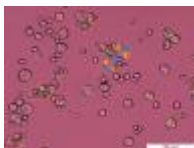
Optical micrograph (OM)