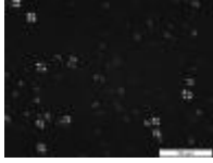
Optical micrograph (OM)