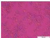
Optical micrograph (OM)